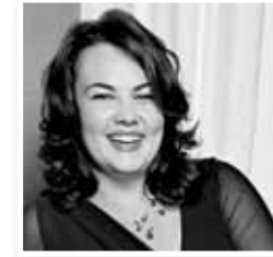
LAURA BRITT VERVANO BY LAURA BRITT DESIGN

The Masland Le Shag custom area rug is made of natural and synthetic materials. The silky fibers are plush to the touch and stimulating to the senses, perfect for this bedroom. The Horizons window treatments—custom natural woven shades—lend warmth to the room while still being functional.