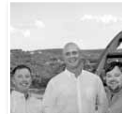
TIM BENTON LAND RESTORATION

Vervano's Capra console adds statement-making splendor to the Shobergs' entryway with its clean lines, fusion of metal and wood, and a "floating" cantilevered top. Dimensions were customized per the clients' needs—a service Vervano provides for many pieces in this collection.