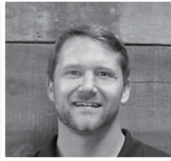
EJ RATHBURN HARDWOOD DESIGNS

3698 RANCH ROAD 620 SOUTH, SUITE 101 | AUSTIN, TEXAS 512.579.0990 | EJ@HARDWOODDESIGNS.NET | HARDWOODDESIGNS.NET